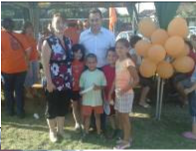
Our picture with the Mayor of Arad

In July, the city hall sponsored an event in our local Bujac neighborhood. The children and staff received an invitation to attend. The mayor of Arad was kind enough to pose for a picture with us!