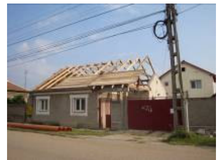
New roof at House of Joy

hydro insulation: 4000 euro flooring/walls/ceilings/doors/ plastering: 19600 euro plumbing and heating system: 5700 euro electrical: 2400 euro external insulation : 4500 euro tables and chairs 150 euro special mattresses 750 euro