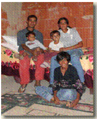
Reintegrated child with her family .

Oaza continues to provide support to children who used to be in Oaza's care, but have now been reintegrated into their natural families or placed with another family. Oaza's support is offered for a year or