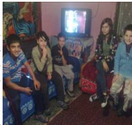
Oaza children visiting a reintegrated child .