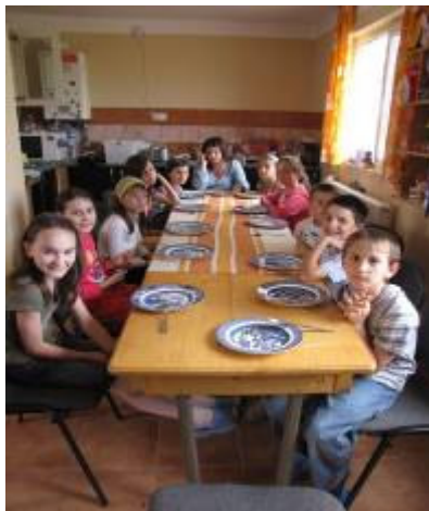
After school kids at lunch time

These projects were born out of the Oaza but they agreed to pray for us that God childrens' desire to help children less would make a way to restart the after-school fortunate than themselves in the local programme in September, and for us to be community. The Oaza children noticed that able to take 24 children. At the same time, they were better off - they had clothes, some of the mums from the 'mums and tots' food, a warm home - than some of the children in their neighbourhood. They wanted to invite the local children to spend time in their home. When Laura looked into it, she realised that there were many children in desperate need locally - living on the edge of poverty, dropping out of school and lacking supervision during the day.